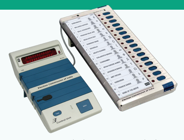
Control Unit (CU) and Ballot Unit (BU)

The Electronic Voting Machine used by the Election Commission of India (ECI) is a standalone machine. It is not connected to any network and has no provision for any input except from the Ballot Unit. EVMs have been used by ECI from General Elections to State Legislative Assemblies & Bye-elections to Assembly/Parliamentary Constituencies since 2000. Successful use of EVMs has given a quantum leap to India's credibility in conducting elections worldwide.